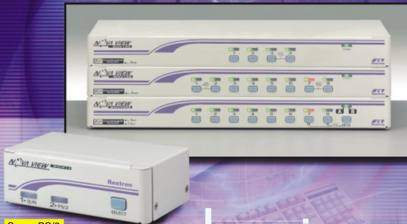
Sun + PS/2